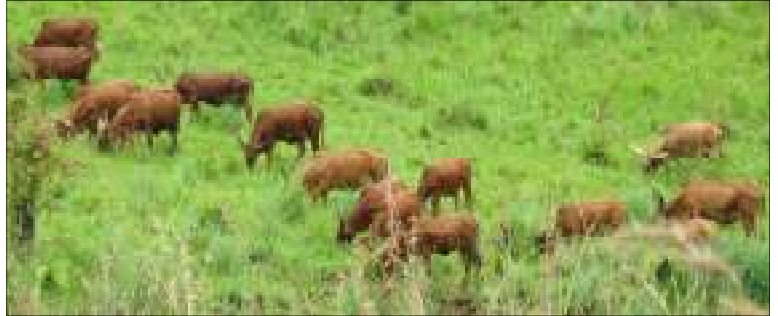
Cows grazing in the bush

The children need 150 liters of milk per day. The plan is to start a herd of 26 cows that would provide the milk and also be used periodically for a meat meal. A herd of 50 goats is also planned to provide meat. BCHC will be able to provide the orphans with chicken, goat or beef meals. Contributions toward these herds are most welcome.