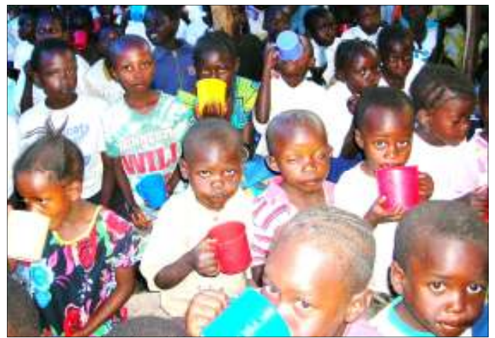
Porridge is good (and makes someone sleepy)