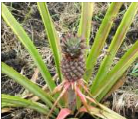
2.4 acres of pineapples

We met with several widows who have started small businesses. They asked that we tell the supporters in the U.S. how much they appreciated what has been done for them. Now there are evening meals for their families. At this time 80 of the 100 families that needed help have been helped with business loans and many now have their own gardens.