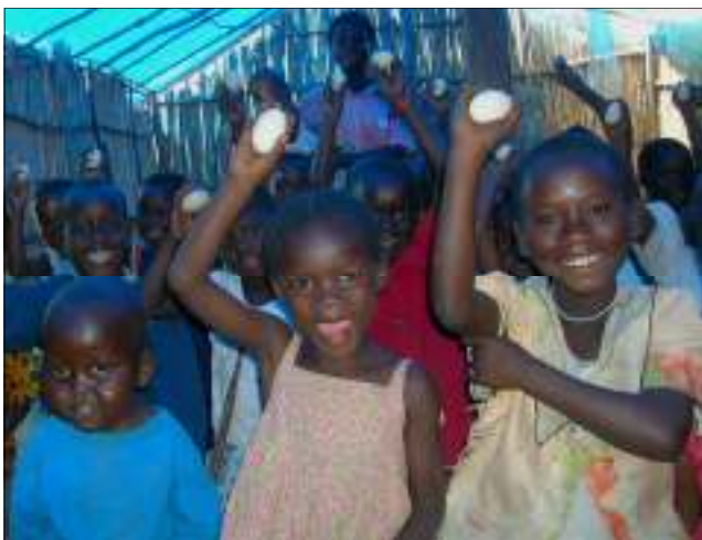
Eating hard boiled eggs