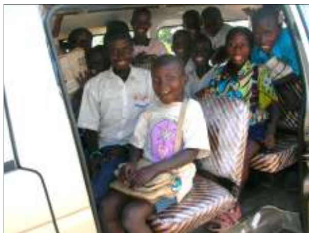
Boys in the new school bus