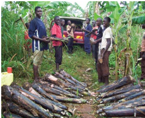
Banana seeds ready for planting