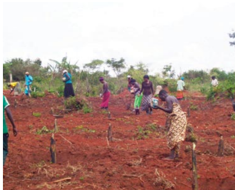
Finished before the rains started again